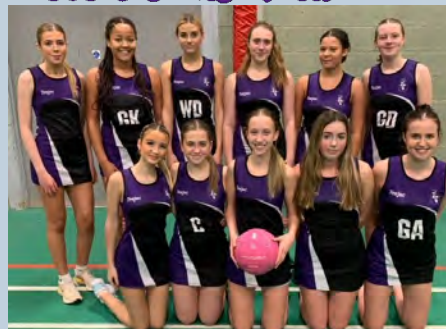
Under 18 Netball Team who won the Anglesey tournament

Nadolig Llawn a Blwyddyn Newydd Dda i bawb / A Merry Christmas and a Happy New Year to everyone