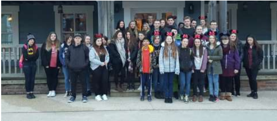
Disgyblion gwych Yr Adran Dechnoleg, Ysgol David Hughes.

Am y newyddion diweddaraf o'r adran ac ychydig mwy o luniau'r daith gallwch ddilyn yr adran ar Twitter: @DT_YDH .