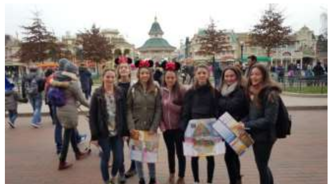
About to enjoy a day at the park!