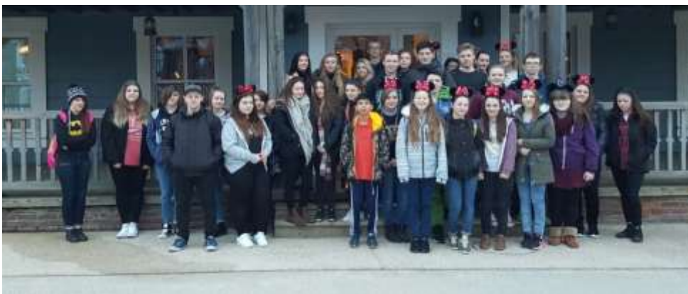
Ysgol David Hughes's fantastic Technology Department pupils.