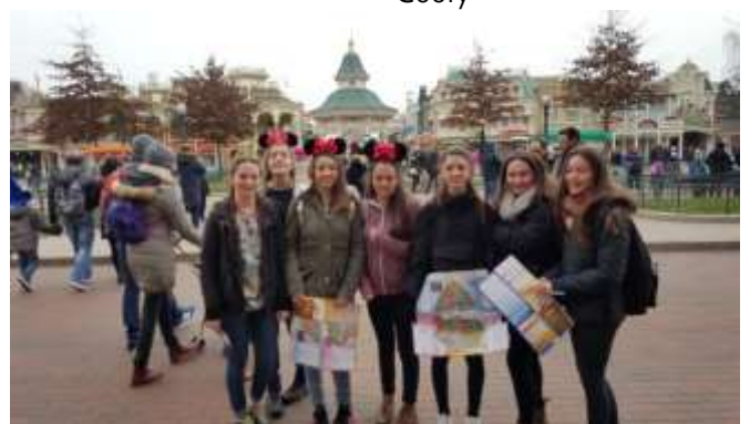
Ar fin mwynhau diwrnod yn y parc!