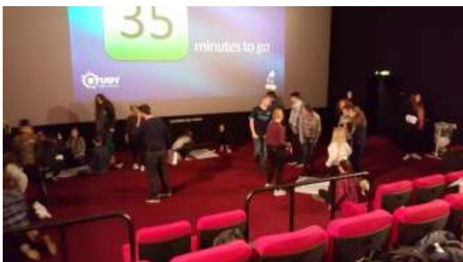
Gweithio'n galed yn y gweithdy!