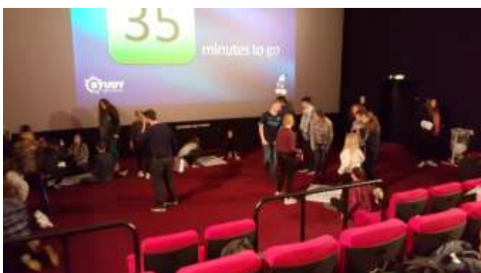
Working hard in the workshop!